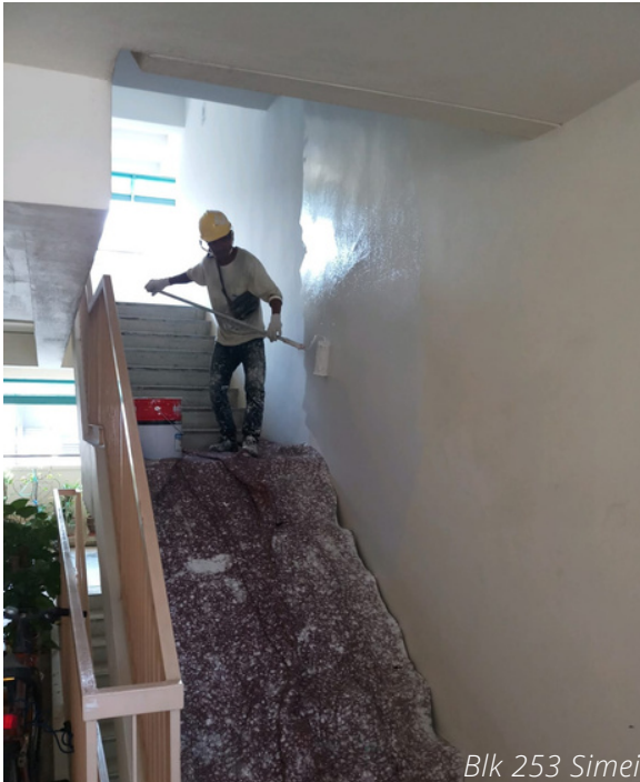
Blk 253 Simei

At the start of each financial year, we set aside our budget to plan for comprehensive cyclical work programmes. This is one of our major expenditure and is essential in keeping our homes and common facilities in good condition.