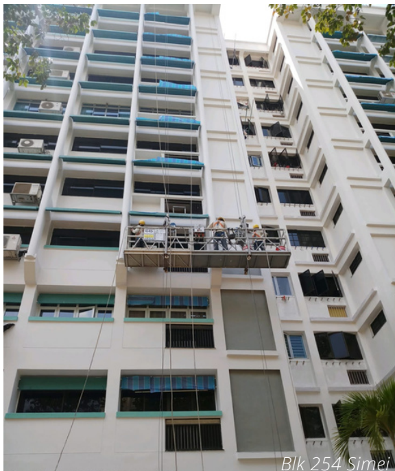
Blk 254 Simei

In this financial year, a total of $5.62 million was spent on these essential works.